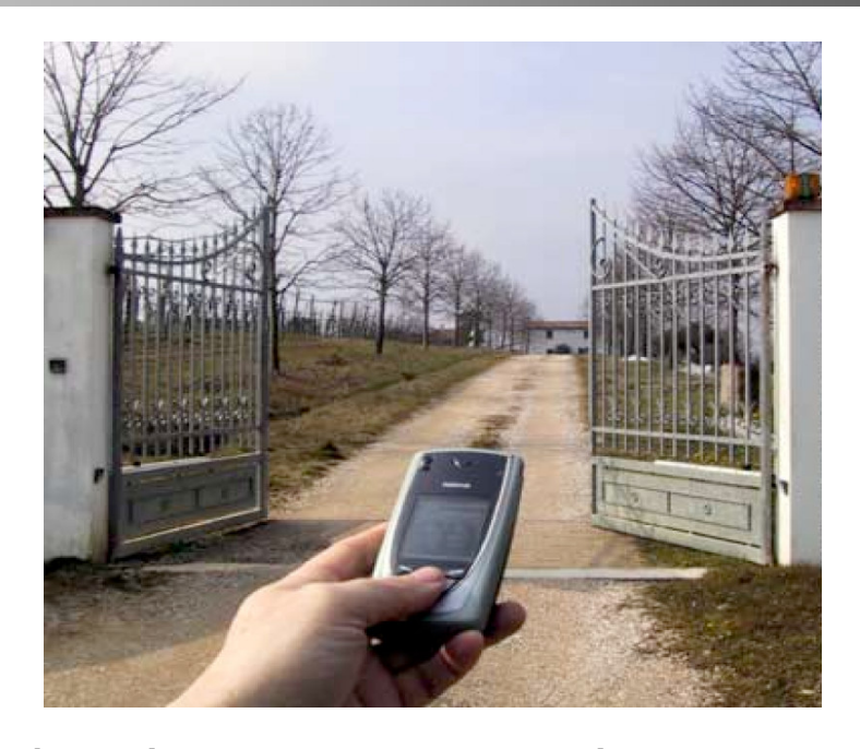
Electronic KIT to convert your gate into a GSM gate